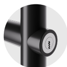
Rim cylinder Small Format Core